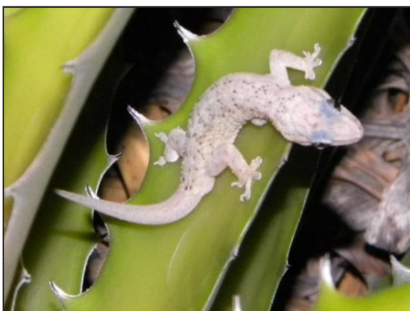
Figure 1. Nocturnal activity of adult specimen Hemidactylus agrius on leafblade of Encholirium spectabile .

According to Passos; Borges-Nojosa, (2011), Hemidactylus agrius is a little-studied species whose geographical distribution is restricted to northeastern Brazil where it has been recorded in the Caatinga (VANZOLINI, 1978, VANZOLINI et al., 1980) and Cerrado Domains (ANDRADE et al., 2004). Rodrigues (1986) records the presence of H. agrius in the Caatinga of Cabaceiras municipality (Paraíba state, NE Brazil), where it is abundant on rock outcrops, while emphasizing its absence in other localities of the semiarid Caatinga. Despite the fact H. agrius had been recorded from the states of Ceará, Paraíba, Pernambuco, Piauí, Maranhão and Rio Grande do Norte (VANZOLINI et al., 1980, RODRIGUES, 2003, BORGES-NOJOSA; CASCON, 2005, FREIRE et al., 2009, ANDRADE et al., 2013), no report mentions the occurrence of H. agrius in association with bromeliads. Since there is no published report on geckos associated with Encholirium species, a bromeliad genus endemic to xeric areas in Brazil (FORZZA et al., 2003), the main goal of the present study is to provide preliminary information regarding the biology of H. agrius in association with this bromeliad growing on rock outcrops in the Agreste region, northeastern Brazil.