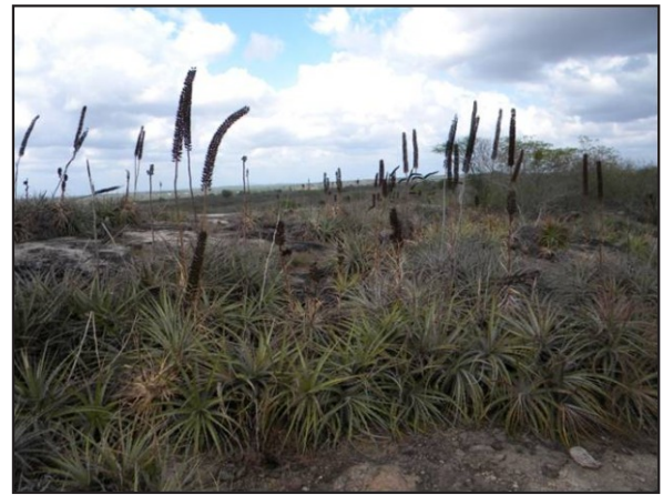
Figure 2. General view of rock outcrop in Santa Maria (RN) with thickets of Encholirium spectabile .

The field work was carried out from December 2009 through September 2010 during a survey of the herpetofauna in Santa Maria municipality (5.854° S, 35, 701° W, WGS84 datum, 137 m elevation, Rio Grande do Norte state, Brazil), the area was characterized according Rizzini (1997), where recognizes within the Caatinga Domain a ecotonal region close to the Atlantic forest called “Agreste” characterized by higher air humidity values, deeper soil profiles and dense vegetation. We observed specimens of a gekkonid lizard in association with thickets of Encholirium spectabile growing on rock outcrops (Figure 2). Specimens of a gecko were collected, identified as Hemidactylus agrius and deposited in the Herpetological Collection of the Departamento de Botânica, Ecologia e Zoologia of UFRN (CHBEZ nr. 3354). The bromeliad specimens were identified according to Smith e Downs (1974).